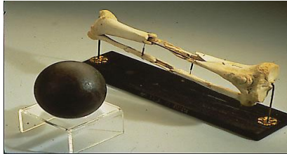
General Sickles Leg